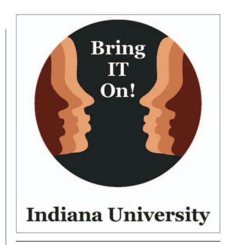
Figure 3. Bring IT On! logo. Workshop attendees learned how to create an outreach program and received information about different postcollege career paths.

From the COIN workshop, we learned that we needed to give participants more time and help when preparing their initial presentations. In particular, many participants knew little about the computing research and activities at their school. This led us to assign a Just Be volunteer to every school represented at Bring IT On! The volunteers compiled information about the schools in advance, giving participants valuable sugges-